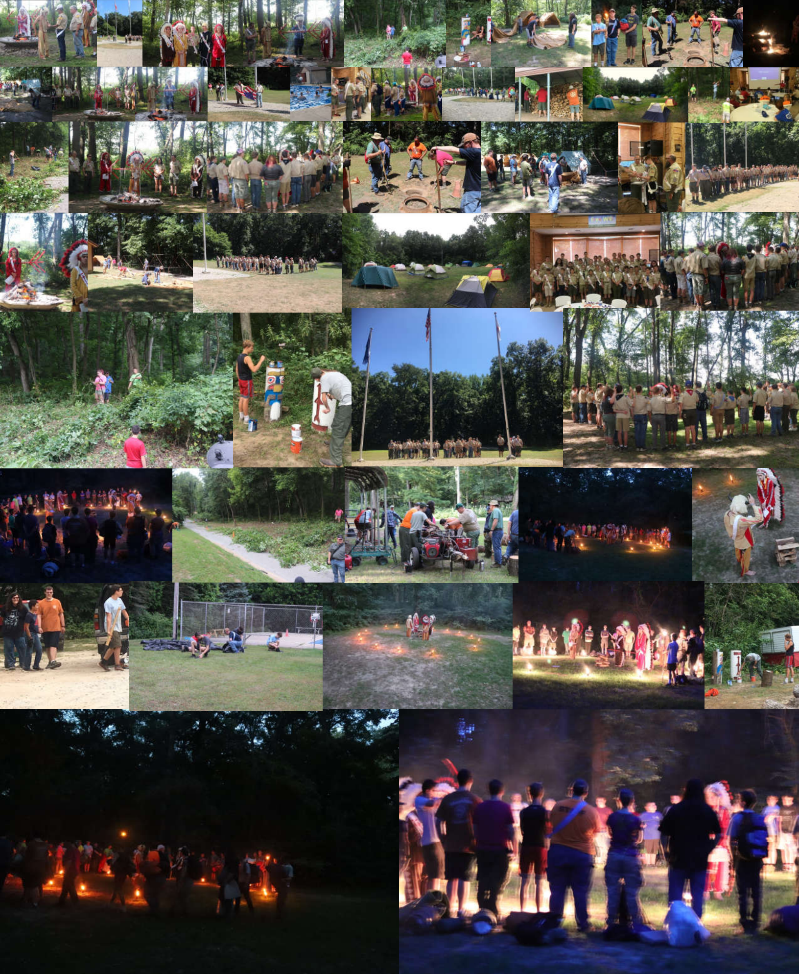
Photos shown are from the 2019 Summer OA Weekend.