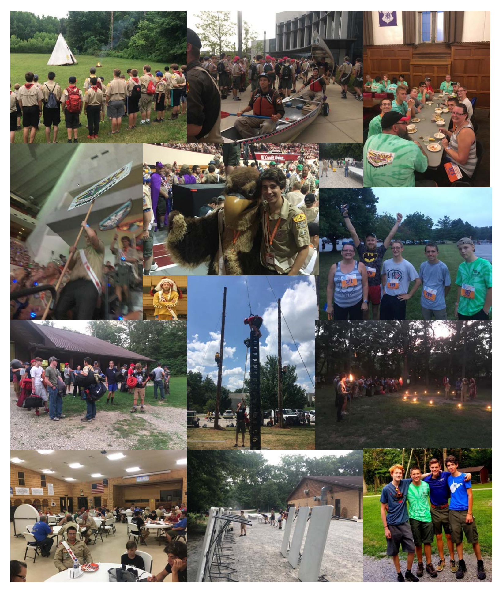
We are Takachsin Lodge! Above are photos from the 2018 NOAC at Indiana University, from the 2018 Summer OA Weekend and from 2018 Summer Camp Call outs!