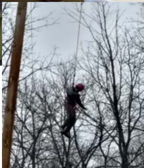
Above are some photos of training, meals, church and fun activities (flying squirrel) that was held at the 2018 Section C6A conclave at Camp Chief Little Turtle.