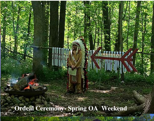
Ordeal Ceremony- Spring OA Weekend