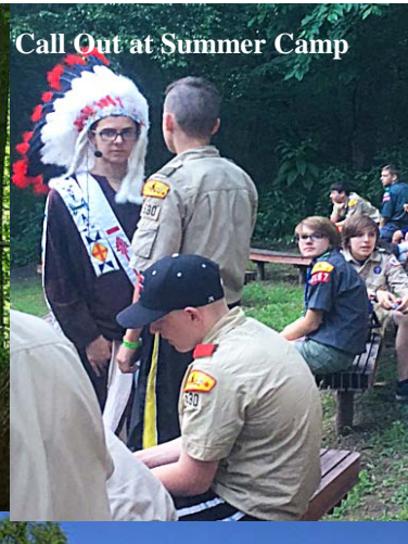
Call Out at Summer Camp