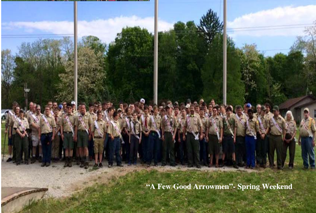
"A Few Good Arrowmen"- Spring Weekend