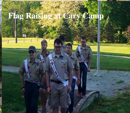
Flag Raising at Cary Camp

A few photos of our Lodge Activites since the last newsletter. These include the Spring OA Weekend at Cary Camp in May, and Call Out Ceremonies which are done each week of summer camp at Camp Buffalo. "WE ARE TAKACHSIN LODGE".