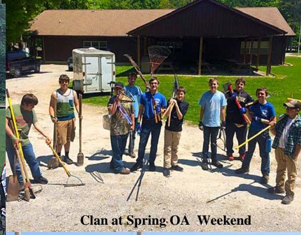
Clan at Spring OA Weekend