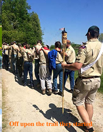
Off upon the trail they started