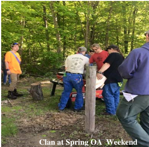
Clan at Spring OA Weekend